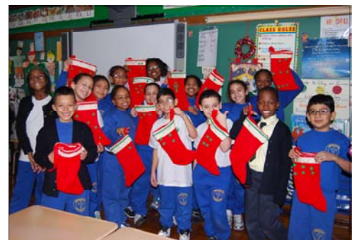
The Sewing Club shows off its handiwork!

ICS’s varied after-school enrichment offerings are continuing to grow and expand this year. Students enrolled in the after-school program are participating in popular returning activities such as Sewing Club, Drum Club, and volleyball as well as in the new Board Game Club for first graders. In addition to participating in activities, students have ample time to finish their homework and play with friends. ICS is working to expand its after-school opportunities to its older students as well, with plans to form a competitive debate team and offer a special news literacy program in 2012. Engaging special activities like these ensure that learning extends beyond the classroom and showcase the skills and talents of our ICS students and staff.